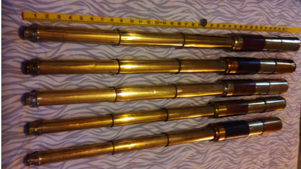
5 Dolland 3-draw mahogany barrel Day or Night with splash shield & 4 lens Schyrle-Huygens eyepiece

Note the similarity in appearance. The method of construction is identical. The eyecups are strikingly similar and are typical of the period c1820. They all have cover slides, to the object glass and the eye lens. The OG cover & slide is missing off one of them. It is easily lost because they simply push into the splash shield and are not an especially secure fit.