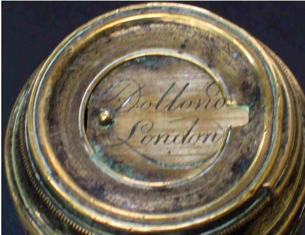
Signature on a Dollond single draw telescope #128 c1770

I also have two other Dollond Gentlemen's telescopes made with red Honduran flame mahogany barrels to a very high standard. The both have OG's with green crowns, and both c1825. Their signatures also share the same flourishes to the "D"s & "L"s.