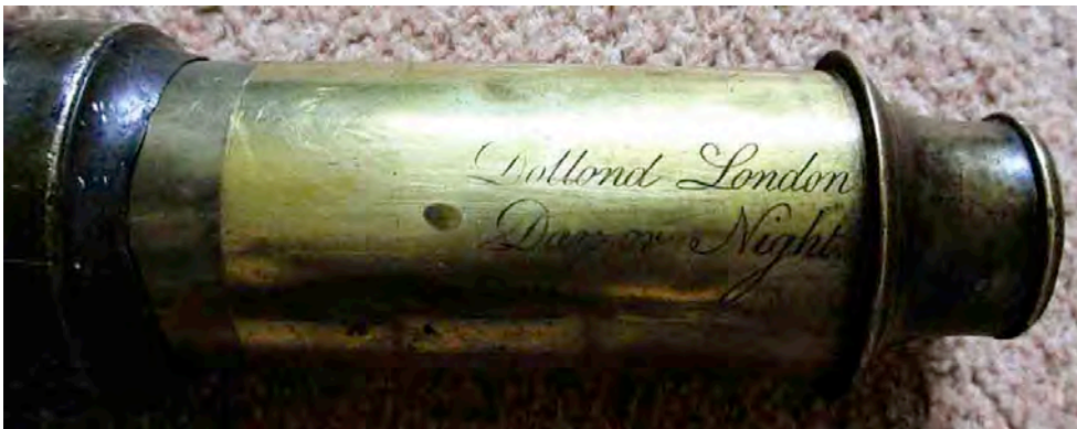
Dollond signatures engraved in the supposed style of the House of Dollond. Note the similarities, and variations.