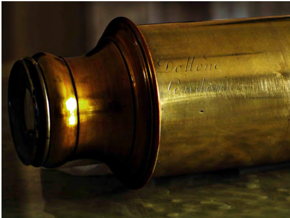
Signature on a Dollond Huygenian eyepiece off a Night telescope c1780

Prior to this c1770 the 'd' in "Dollond" and "L" in "London" had more exaggerated flourishes.